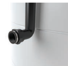
Female BSP Adapter