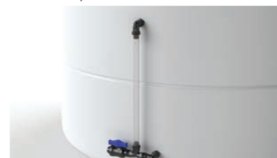
Bund Sight Gauge