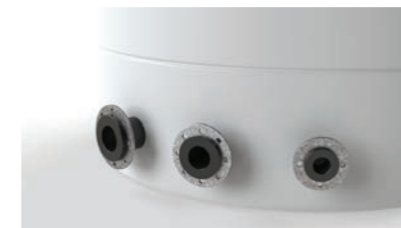
PN 16 Flange