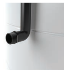
Male BSP Adapter Nipple