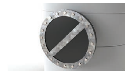
620mm Side Access Manway