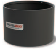
2,800 Litre 17200601 1900 dia x 1300 H 615 gallons 2.8 cubic metres