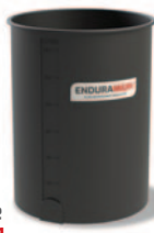
500 Litre 17200201 890 dia x 1206 H 109 gallons 0.5 cubic metres