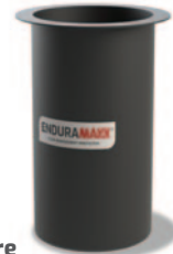
400 Litre 17200101 800 dia x 1300 H 87 gallons 0.4 cubic metres