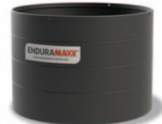
7,500 Litre 172018 2600 dia x 1700 H 1650 gallons 7.5 cubic metres