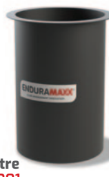
800 Litre 17200301 1160 dia x 1280 H 175 gallons 0.8 cubic metres