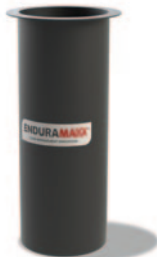
500 Litre 1720002 880 dia x 1560 H 109 gallons 0.5 cubic metres