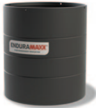
5,000 Litre 17201501 1900 dia x 2300 H 1099 gallons 5 cubic metres