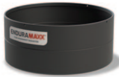
5,000 Litre Low Profile 17201401 2600 dia x 1500 H 1099 gallons 5 cubic metres