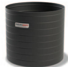
25,000 Litre 17206001 2600 dia x 3200 H 2089 gallons 25 cubic metres