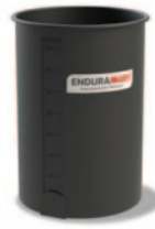
300 Litre 1727010 650 dia x 1030 H 66 gallons 0.3 cubic metres