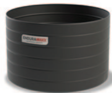
20,000 Litre 17205001 3450 dia x 2200 H 4299 gallons 20 cubic metres