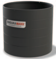
10,000 Litre 172025 2600 dia x 2220 H 2200 gallons 10 cubic metres