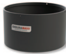
2,000 Litre 17200901 1900 dia x 1100 H 483 gallons 2 cubic metres