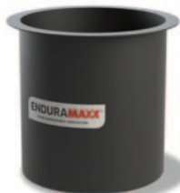
1,200 Litre 17200701 1400 dia x 1320 H 263 gallons 1.2 cubic metres