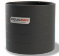
12,500 Litre 17202501 2600 dia x 2600 H 2749 gallons 12.5 cubic metres