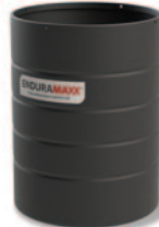
6,000 Litre 17201601 1900 dia x 2500 H 1319 gallons 6 cubic metres