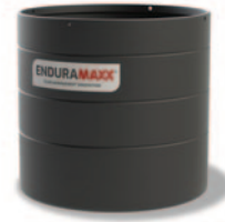
4,000 Litre 17201201 1900 dia x 1875 H 879 gallons 4 cubic metres