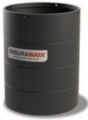
2,500 Litre 17200501 1400 dia x 1800 H 549 gallons 2.5 cubic metres