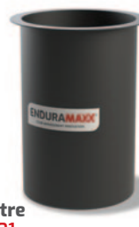
1,000 Litre 17200401 1160 dia x 1280 H 175 gallons 0.8 cubic metres