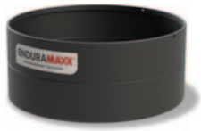
10,000 Litre 172038 3450 dia x 1200 H 2200 gallons 10 cubic metres