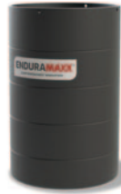
3,000 Litre 17201101 1400 dia x 2135 H 659 gallons 3 cubic metres