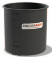
200 Litre 172702 740 dia x 790 H 44 gallons 0.2 cubic metres