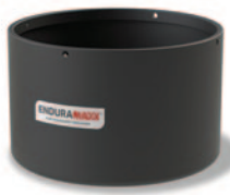
1,300 Litre Low Profile 17270101 1400 dia x 860 H 286 gallons 1.3 cubic metres