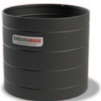
14,000 Litre 172028 2600 dia x 2800 H 3080 gallons 14 cubic metres