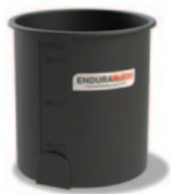
100 Litre 172701 600 dia x 676 H 22 gallons 0.1 cubic metres