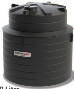
20,000 Litre CTB200001-SK 3450 x 3630 H 44053 gallons 20 cubic metres