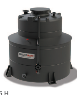
1,500 Litre CTB15001 1900 x 2135 H 330 gallons 1.5 cubic metres