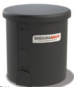
100 Litre CTB1001 700 Dia x 696 H 22 gallons 0.1 cubic metres