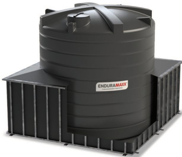
30,000 Litre CTB300001-SK ON SPEC 6608 gallons 30 cubic metres