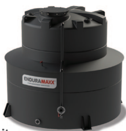
5,000 Litre CTB50001-SK 2600 Dia x 2500 H 1101 gallons 5 cubic metres