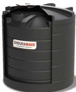
10,000 Litre CTB100001 2600 Dia x 2900 H 2203 gallons 10 cubic metres