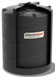
1,200 Litre CTB12001 1400 x 1800 H 264 gallons 1.2 cubic metres