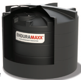
4,000 Litre CTB40001 2400 X 2200 H 881 gallons 4 cubic metres