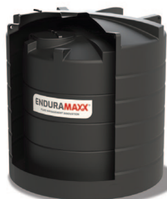
5,000 Litre CTB50001 2400 Dia x 2500 H 1101 gallons 5 cubic metres