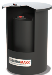
400 Litre CTB4001 1160 X 1580 H 88 gallons 0.4 cubic metres