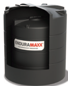
2,500 Litre CTB25001 1700 X 2300 H 551 gallons 2.5 cubic metres