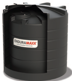
6,000 Litre CTB60001 2600 Dia x 3000 H 1322 gallons 6 cubic metres