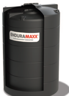
2,000 Litre CTB20001 1900 X 2135 H 441 gallons 2.0 cubic metres