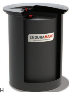
1,000 Litre CTB10001 1400 X 1680 H 220 gallons 1 cubic metre