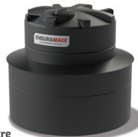
6,000 Litre CTB60001-SK 2600 Dia x 2700 H 1322 gallons 6 cubic metres