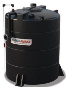
1,500 Litre CTB15001-S 1400 x 2135 H 330 gallons 1.5 cubic metres