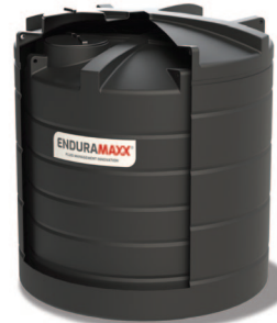
12,000 Litre CTB120001 2850 x 3180 H 2643 gallons 12 cubic metres