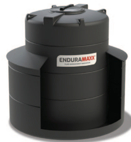
25,000 Litre CTB250001-SK ON SPEC 5507 gallons 25 cubic metres