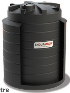
15,000 Litre CTB150001-SK 2850 x 3750 H 3304 gallons 15 cubic metres