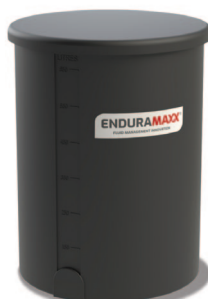
500 Litre CTB5001 1160 X 1680 H 110 gallons 0.5 cubic metres