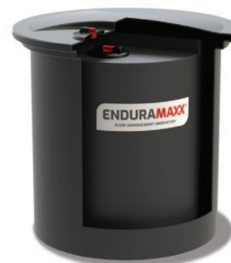
800 Litre CTB8001 1400 X 1280 H 176 gallons 0.8 cubic metres