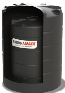
3,000 Litre CTB30001 1700 X 2300 H 661 gallons 3 cubic metres