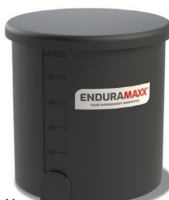
200 Litre CTB2001 760 Dia x 810 H 44 gallons 0.2 cubic metres