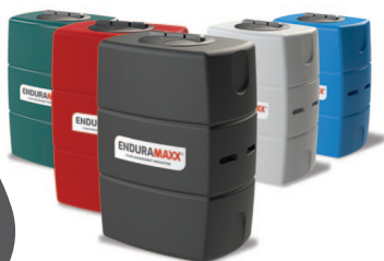
500 Litre Rectangular Slimline Tank 171305 870 L x 650 W x 1200 H (mm) 109 gallons 0.5 cubic metres