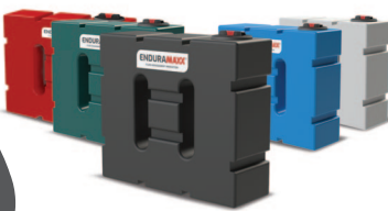
400 Litre Baffled Horizontal Slimline Tank 171504 1200 L x 400 W x 1050 H (mm) 87 gallons 0.4 cubic metres