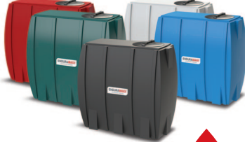
1,000 Litre Slimline Tank 171310 1350 L x 760 W x 1300 H (mm) 219 gallons 1 cubic metre