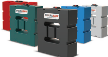
400 Litre Baffled Upright Slimline Tank 171604 1050 L x 400 W x 1200 H (mm) 87 gallons 0.4 cubic metres