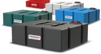
400 Litre Baffled Flat Slimline Tank 171704 1200 L x 1050 W x 400 H (mm) 87 gallons 0.4 cubic metres

Because we design, engineer and manufacture in the UK, our products can also be custom made to client specifications.