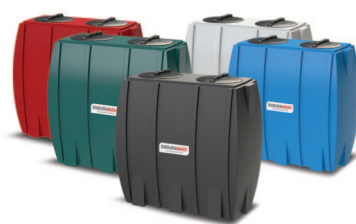
1,000 Litre Rectangular Slimline Twin Lid Tank 171312 1350 L x 760 W x 1300 H (mm) 219 gallons 1 cubic metre